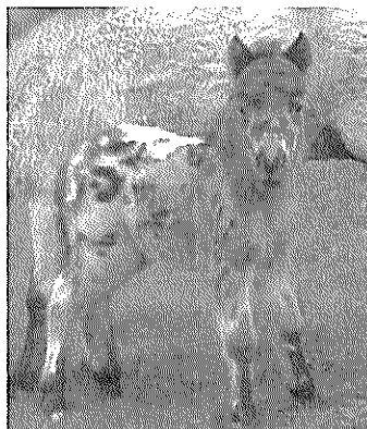
Conundrum Colin The Pirate