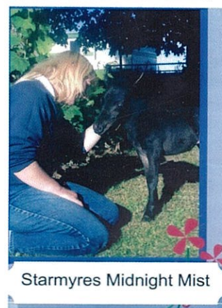
Starmyres Midnight Mist